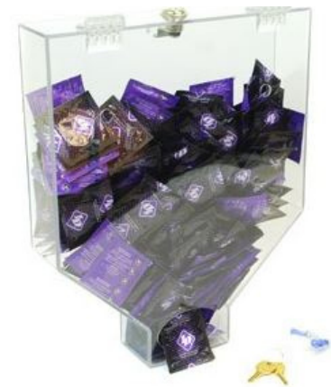
Wall Mounted Dispensers