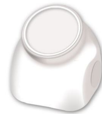
Table Top Dispensers